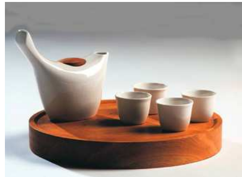
Kotori Sake Serving Set, $295 Designed by Tomi Pelkonen, JUJU Design Party of Finland Porcelain and oak

Incorporating new technology with age-old material, the TO:CA LED clock ($185) displays the time in LED light that emanates through a natural grain, hard-maple wood block. Designed by Kouji Iwasaki of Japan, the TO:CA clock is certain to please modern design enthusiasts on your list. Bestowing the gift of the Lumen pine tree oil lamp ($50) will surely cast the giver in the best light; placed on a shelf or mantle and lit with a match, the