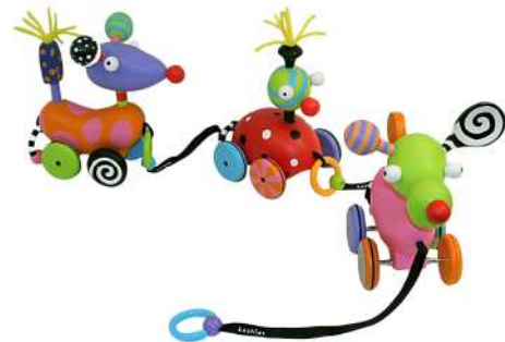
Zolo Pull Toy, $40 Available in three personalities: Scoot, Buggy, and Ozlo Wood Ages 2 and up

Another children's gift as practical as it is entertaining is the Little Miss Piggy Dynamo Flashlight ($18, ages 4 and up). The flashlight is in the shape of a little pig, the nostrils of which are fitted with two bright LED bulbs that recharge within a few seconds of squeezing. With no need for batteries or bulb replacements—ever—the flashlight is great for kids of all ages to keep on hand in the event of an emergency. The wooden Zolo pull toy ($40) is painted in bright colors and fun patterns and has