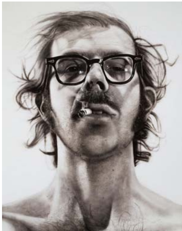
Big Self-Portrait , 1967–68; acrylic on canvas; 107 1/2 x 83 1/2 x 2 in.; Collection Walker Art Center

68)—the artist’s first—and SFMOMA’s recent Self-Portrait (2000–01), a contemporary image painted as a mosaic of dazzling color and the only self-portrait painted on the scale of the 1968 canvas. Throughout the exhibition paintings will be paired with maquettes, and, in some cases, a series of works will be gathered together with the single maquette at its origin. As the viewer moves through the galleries, biographical time unfolds and the artist’s physical maturation is revealed in tandem with his artistic development. The final gallery highlights a suite of recent prints given to SFMOMA by the artist.